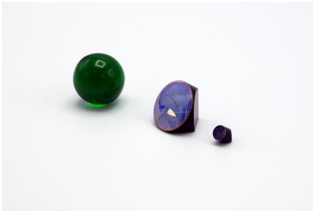
Figure 1. Photograph of SmarAct's retro-reflectors with a 10 mm diameter marble for size comparison.

Retro-reflectors can be used as target for PICOSCALE measurements. They reflect light anti-parallel with respect to the direction of incidence, whereas the orientation of the reflector plays a minor role. Thus, alignment of sensor heads to the target becomes very easy: The measurement beam must only hit the retro-reflector in the center and light will be reflected back into the sensor head so that the PICOSCALE can track the displacement. Furthermore, due to the very limited angular tolerance of a sensor head in combination with a plane mirror, retro-reflectors are often the only possibility to measure large angles. A photograph of variants of retro-reflectors is shown in Figure 1.