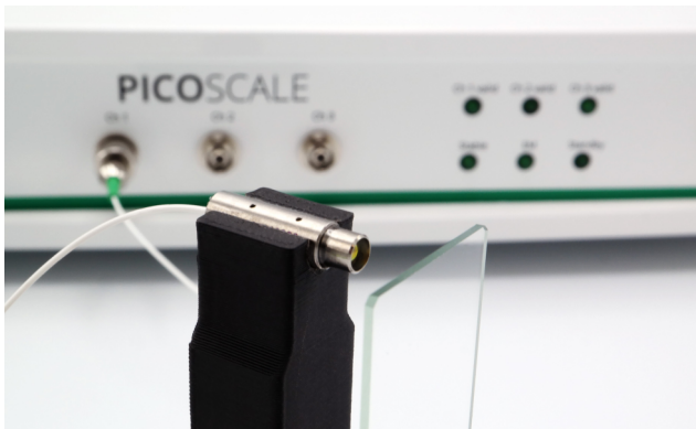
Figure 1. Experimental setup. A PICOSCALE focusing sensor head is directed on a microscope slide and tracks its vibrations.

The PICOSCALE Interferometer is a versatile instrument to record displacements of targets. Due to the Michelson principle, the reflectivity of the targets is not crucial. Thus, measurements on glass windows can be realized with ease.