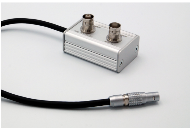
Figure 1. Adapter cable to make the shaker stage signal available through 2 BNC connectors, as DC-coupled and as AC coupled signal.

An adapter cable (Figure 1) is available as accessory to connect other loads to the amplifier output via BNC connectors. In this case, the signal can be used to drive capacitive loads such as piezo actuators. Even capacitances of multiple \mu\text{F} can be connected although the bandwidth will be reduced. The adapter cable also offers an AC-coupled signal to drive inductive loads like voice coils and loudspeakers. The actual bandwidth will depend on the electrical resonance of the electronic circuit which in turn will strongly depend on the connected device.