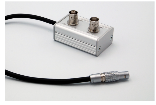
Figure 1. Adapter cable to make the shaker stage signal available through 2 BNC connectors, as DC-coupled and as AC coupled signal.

An adapter cable (Figure 1) is available as accessory to connect other loads to the amplifier output via BNC connectors. In this case, the signal can be used to drive capacitive loads such as piezo actuators. Even capacitances of multiple \mu F can be connected although the bandwidth will be reduced. The adapter cable also offers an AC-coupled signal to drive inductive loads like voice coils and loudspeakers. The actual bandwidth will depend on the electrical resonance of the electronic circuit which in turn will strongly depend on the connected device.